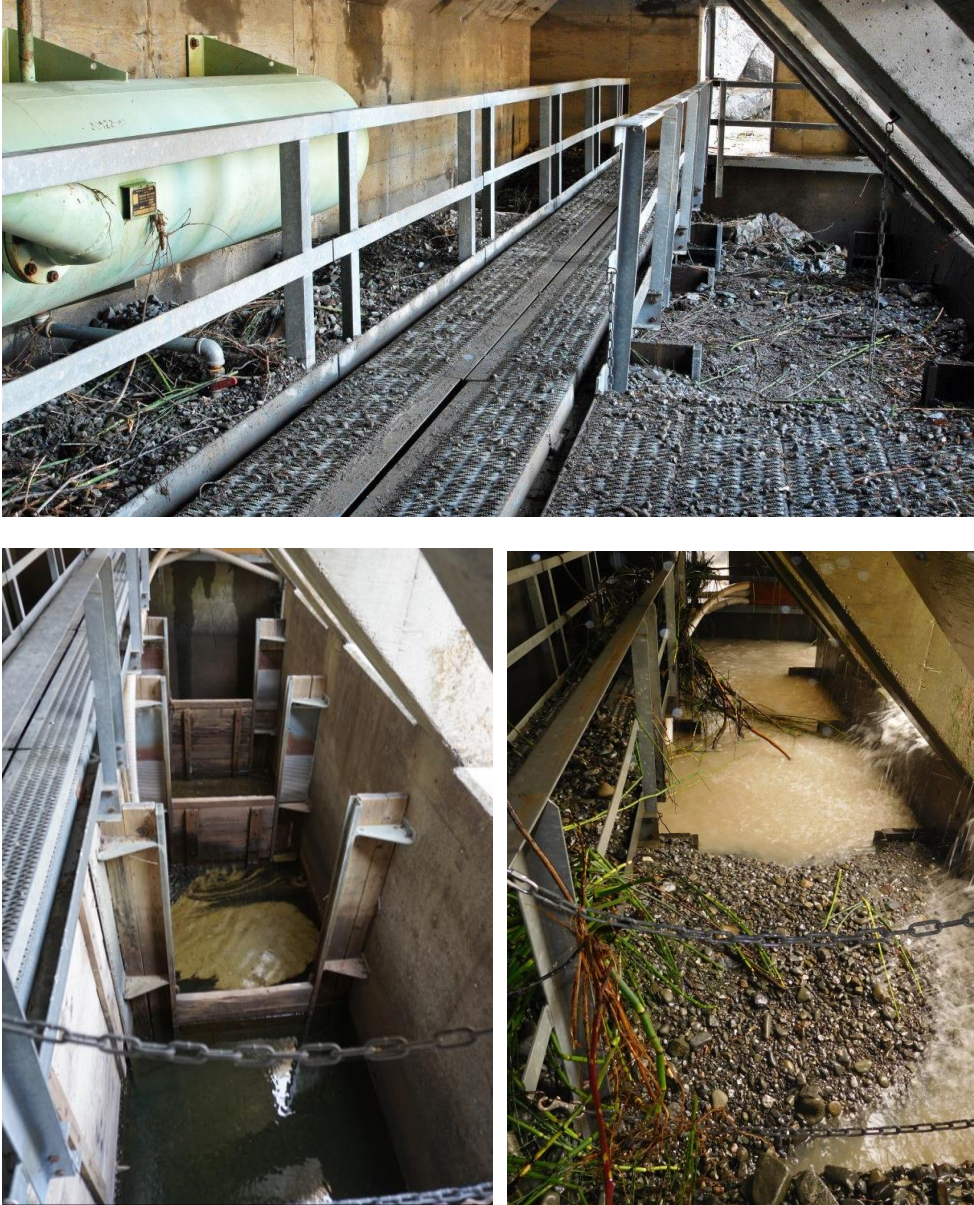
Figure 2. Three views of the first pools of the fish ladder inside the hotel. The upper photo was taken in 2006. The lower left photo was taken August 23, 2018. The lower right photo was taken on March X, 2019.