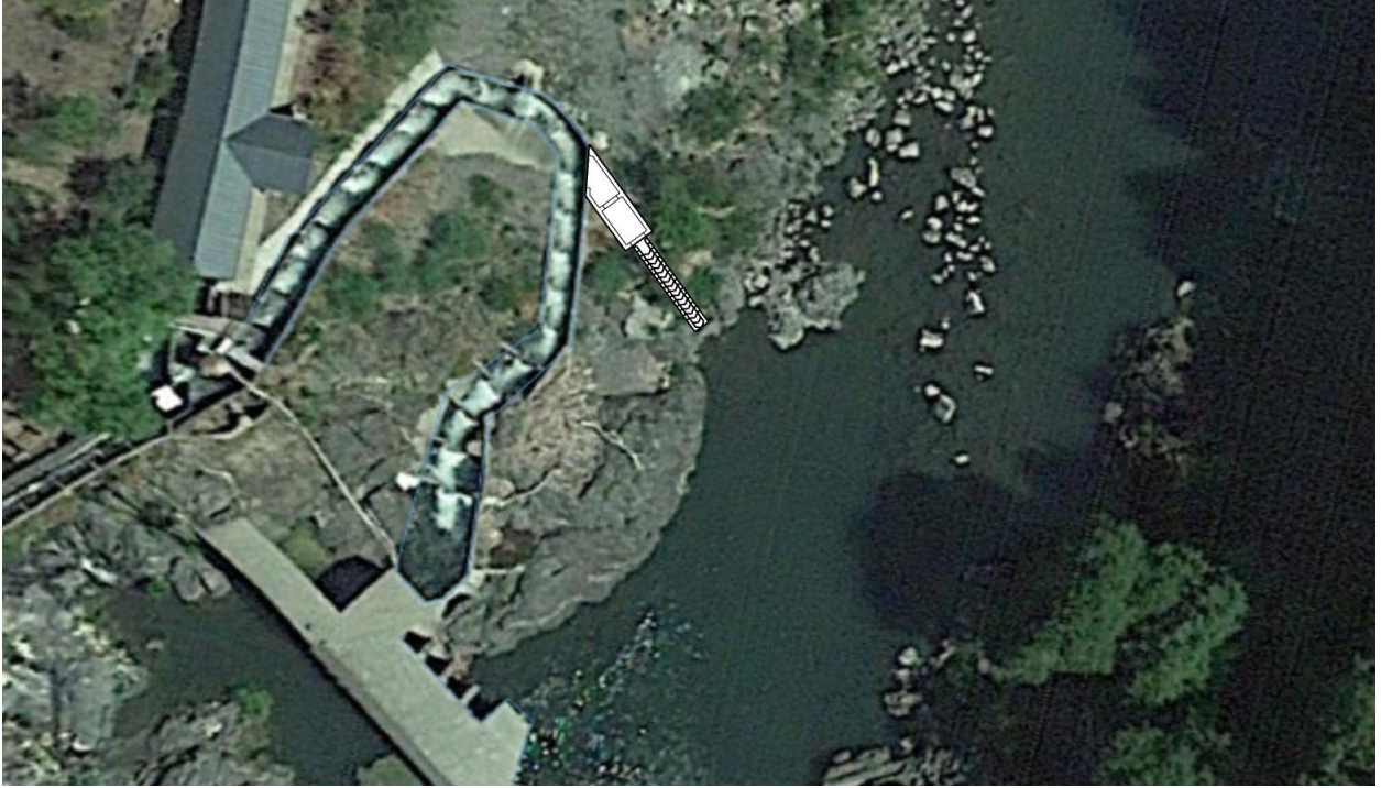
Figure 3. Sketch of one possible layout for a Denil fish ladder that could be used to bypass the lower pools of the existing fish ladder. The concept includes adding two concrete fish ladder pools on the bypass spur and a 25 ft. long Denil fishway. The background photo shows the river at low conditions. The river level would be much higher when the fishway bypass is needed.