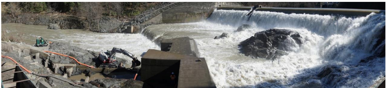
Figure 1. Panoramic photo of Cape Horn Dam and the lowest portions of the fish ladder taken during the site visit on March 13, 2019. The river flow was 1,700 cfs. The vacuum truck is out of view to the left.

The participants agreed that options listed above could improve fish passage efficiency using the existing fish ladder, but even with improvements the fish ladder would be vulnerable and inefficient for operations and maintenance. Completely replacing the existing fish ladder with a design that would prevent the river from overtopping the lower pools should be considered. A new, efficient fish ladder would be designed to meet current design guidelines for pool size and hydraulics for salmonids and lamprey, and include features to aid in operations and maintenance.